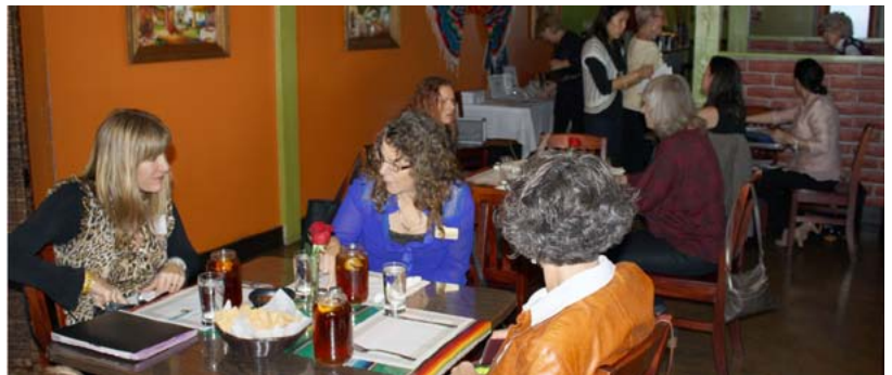
Members and guests enjoy visiting over lunch.