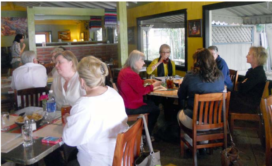
SBWN members and guest enjoy visiting over lunch before the speaker's presentation.