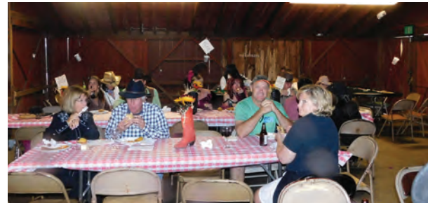
The Red Barn was the perfect setting for an old west style benefit.