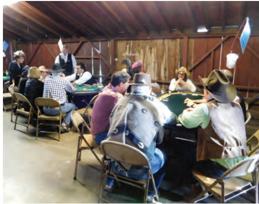
Poker and Texas Hold 'em provided fun for both members and guests.