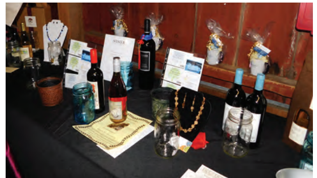
Jewelry and wine was a theme of the evenings raffle prizes.