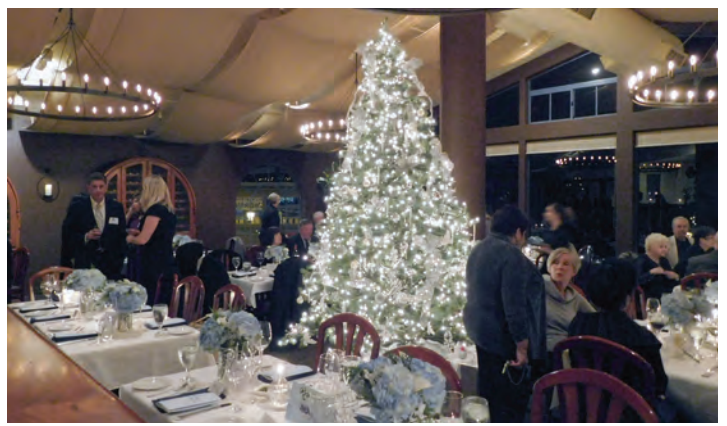
MORE PHOTOS - page 2 and 4